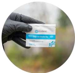
Nuclear Detection wipe