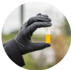
Single Use Test